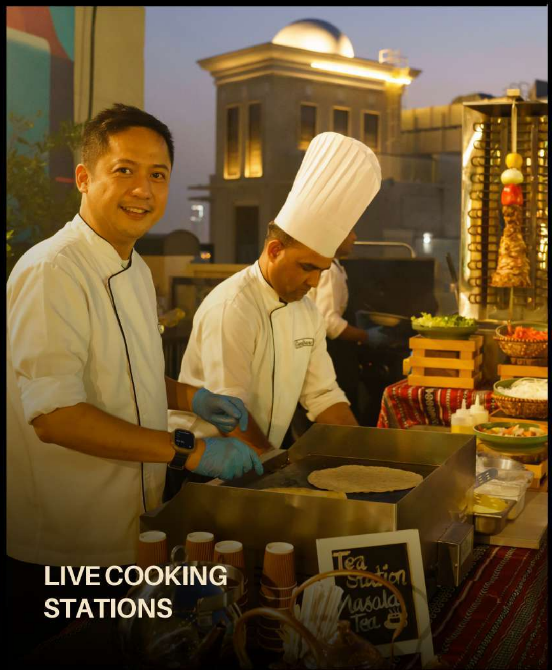
LIVE COOKING STATIONS