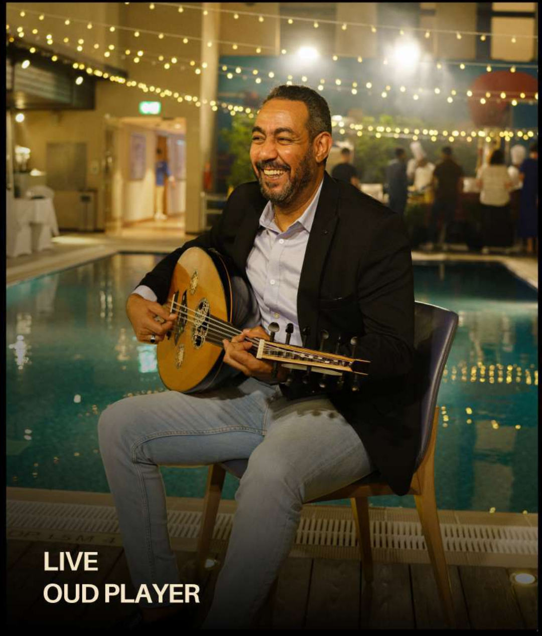
LIVE OUD PLAYER